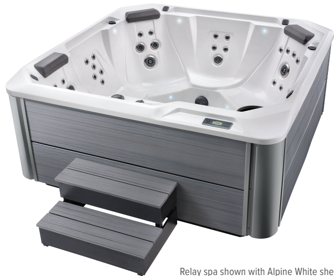
Relay spa shown with Alpine White shell, Storm cabinet and Storm Hot Spot Collection Step.