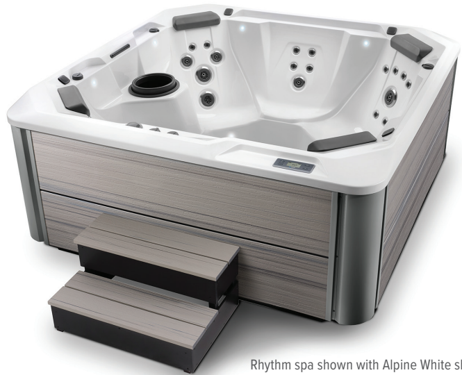
Rhythm spa shown with Alpine White shell, Almond cabinet and Almond Hot Spot Collection Step.