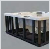
Polymer Substructure & Base Pan