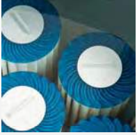
100% Filtration SilentFlo Circulation