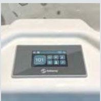
Color LCD Touchscreen