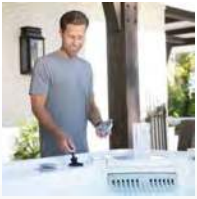
FreshWater® Salt System Included