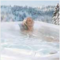
Super Energy Efficient