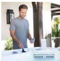
FreshWater® Salt System Ready