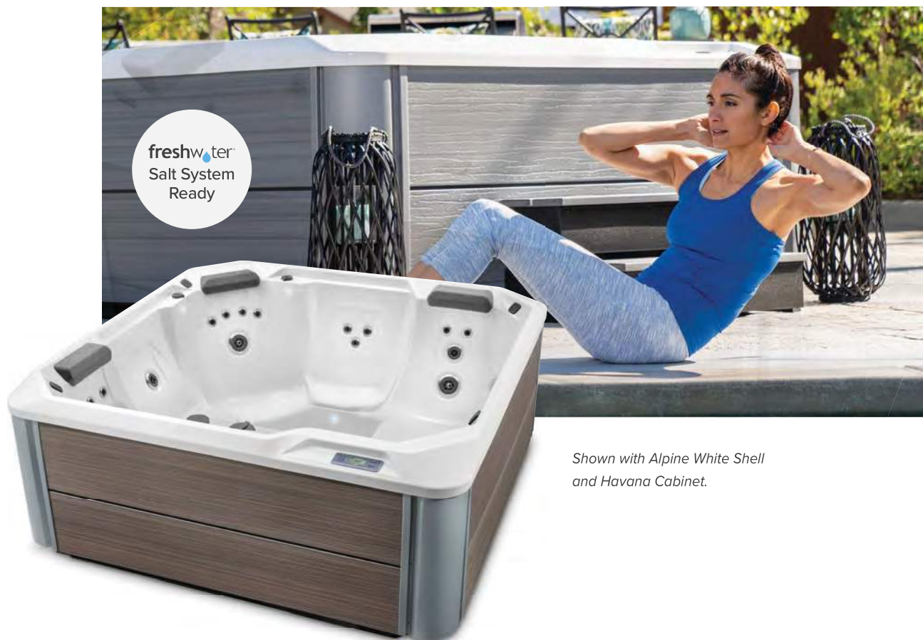
Shown with Alpine White Shell and Havana Cabinet.