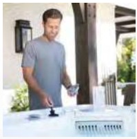
FreshWater® Salt System Ready