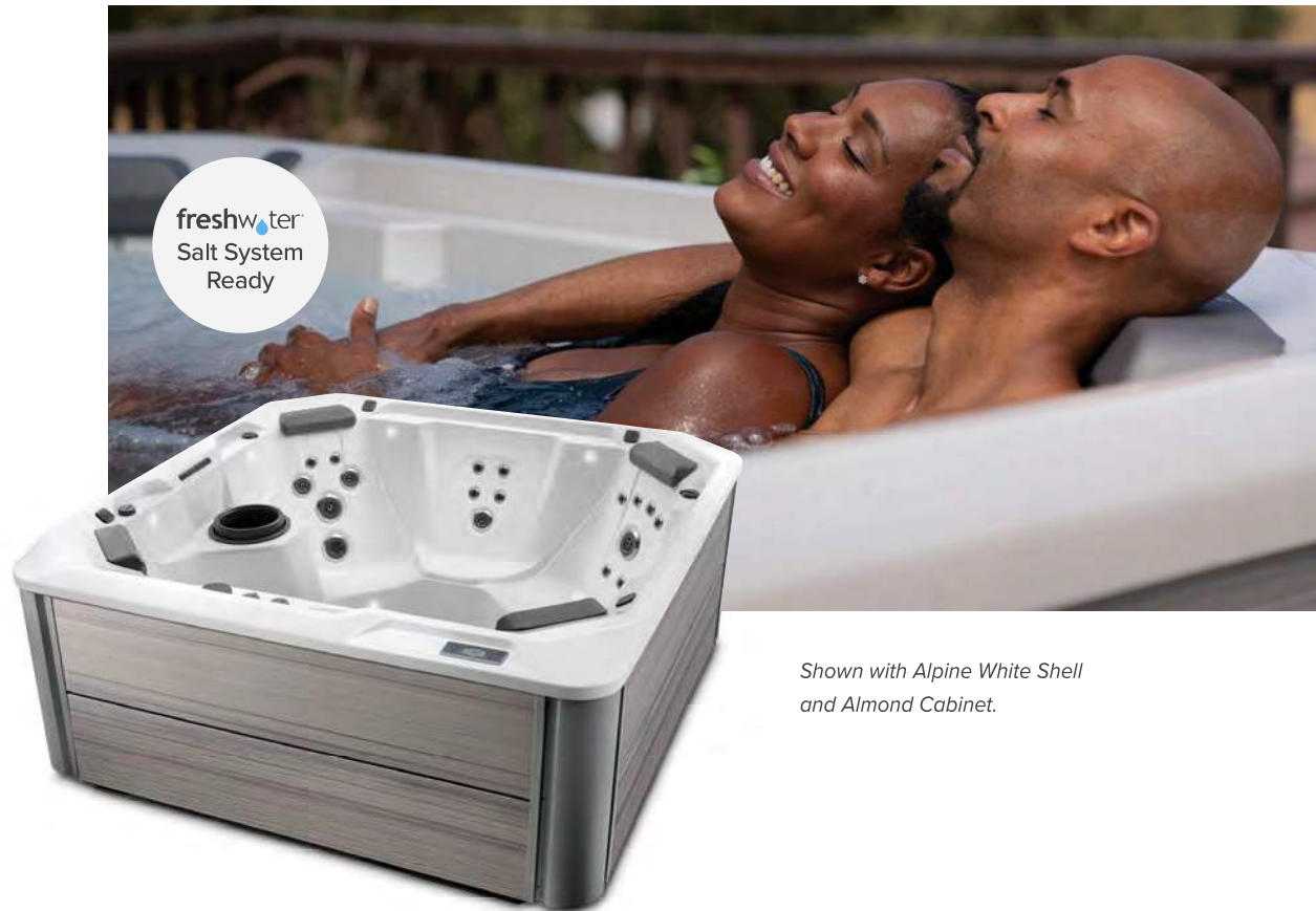
Shown with Alpine White Shell and Almond Cabinet.

People Seating Jets Voltage 7 Seats Open 40 Jets 230 V