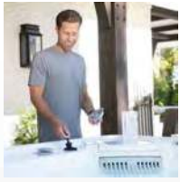
FreshWater® Salt System Ready