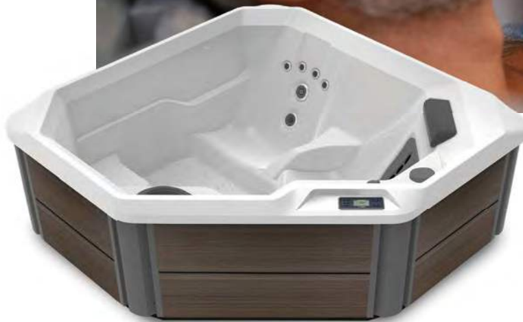
Shown with Alpine White Shell and Havana Cabinet.

People Seating Jets Voltage 2 Seats Open 11 Jets 115 V or 230 V