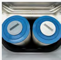
Dual Action Filtration SilentFlo Circulation