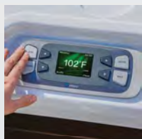
Color LCD Display