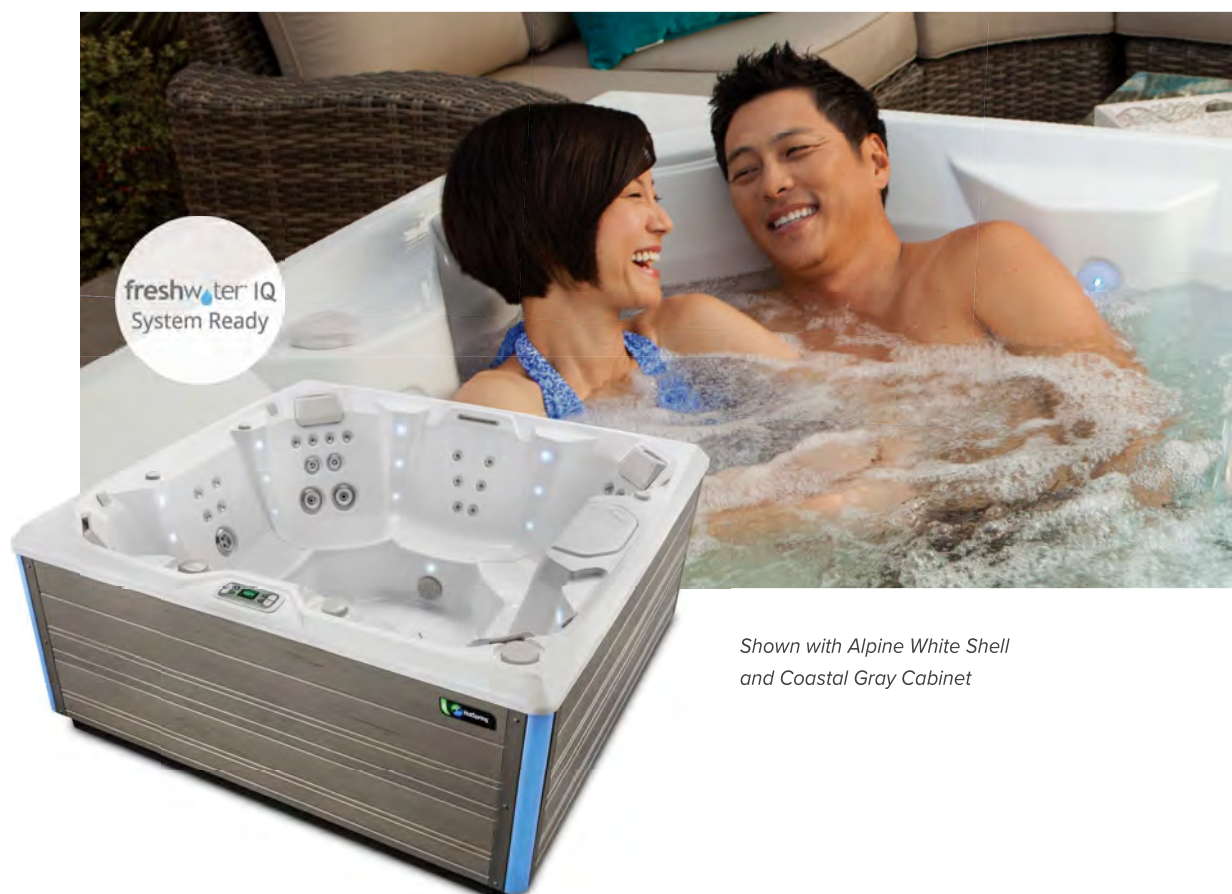
Shown with Alpine White Shell and Coastal Gray Cabinet

People Seating Jets Voltage 7 Seats Open 49 Jets 230 V