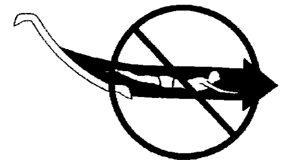
FIGURE M HEAD FIRST