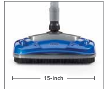
15-Inch-Wide Cleaning Path Captures more dirt and debris in a single pass for a faster clean

Bristle-Drive Technology combines deep-cleaning scrubbing action and a powerful, oversized vacuum inlet