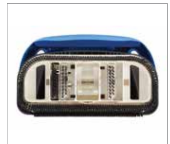
Oversized Vacuum Inlet Devours small and large debris