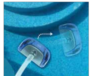
SmartTrac Programmed Steering Navigates around pool obstacles for uninterrupted cleaning