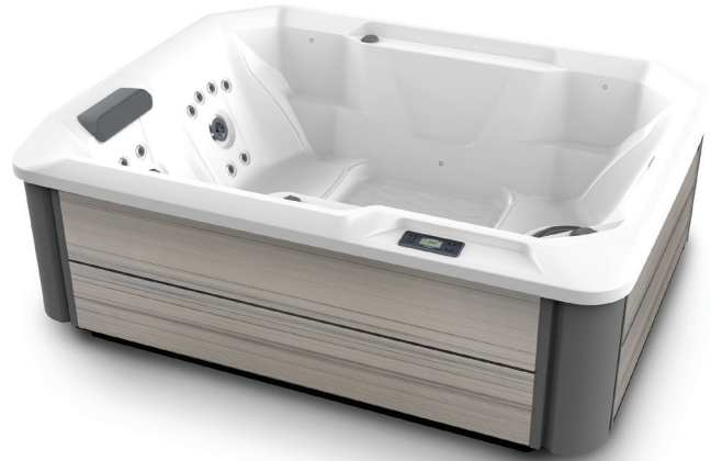
Stride spa shown with Alpine White shell and Almond cabinet.