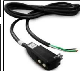
FreeFlow 15a GFCI Plug