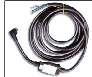
TX 15a Inline GFCI Cord