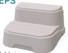
Available in Dune or Smoke