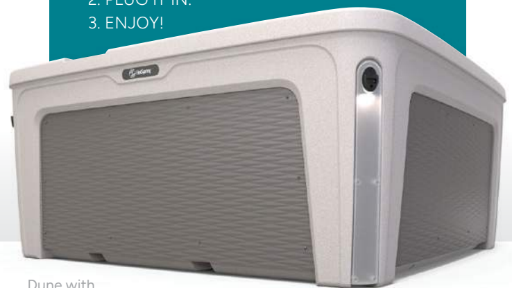
Dune with Diamond Weave