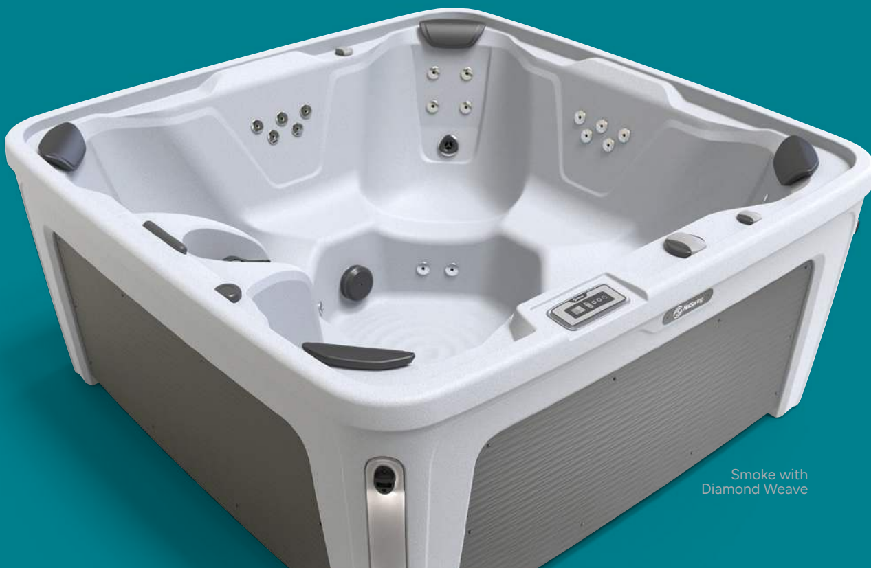
Smoke with Diamond Weave

Freeflow Collection spas come ready for the FROG® sanitizing system. Prefilled cartridges automatically release sanitizer and minerals to keep water soft, clean, and clear with less effort. Available in the U.S. only; bromine is available in Canada.